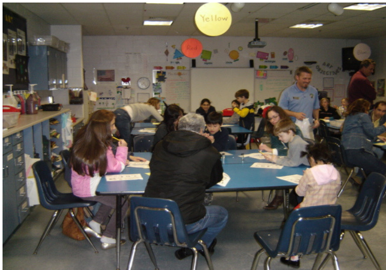
Parents and students learning how to identify stream insects and how their presence or absence can be an indicator of stream health.